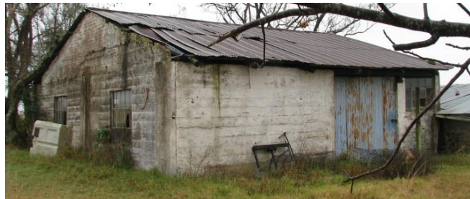
Figure 4 Ancillary structures include a farm shed, silo and stone walled animal shelter/shed.