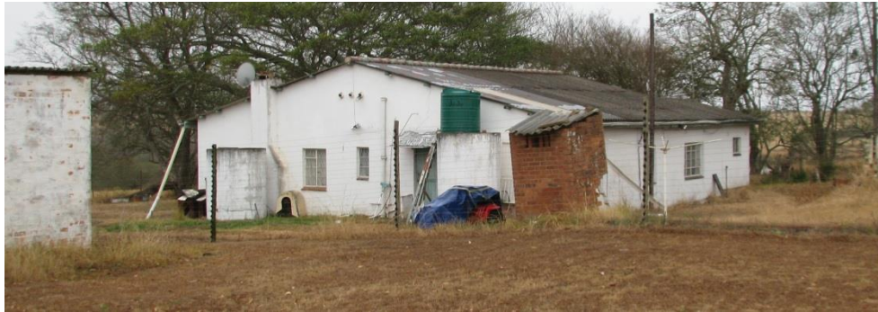
Figure 3 Main dwelling is described by the occupant as being built with dressed stone that have been plastered over.

A farm house and ancillary agricultural buildings of the Thorndale farmstead are older than sixty years and therefore generally protected in terms of the KZNHA.