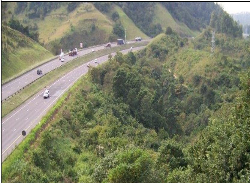
Giba Gorge Area, looking east