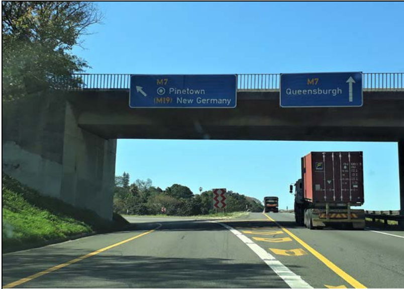
N3 east bound glide off to M7 (Farningham IC).