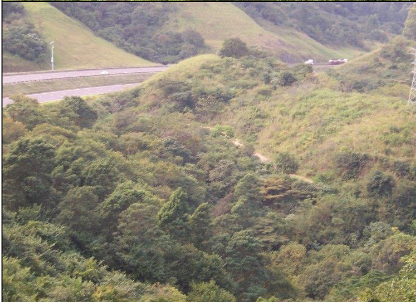
Giba Gorge Area in vicinity of proposed viaduct access road