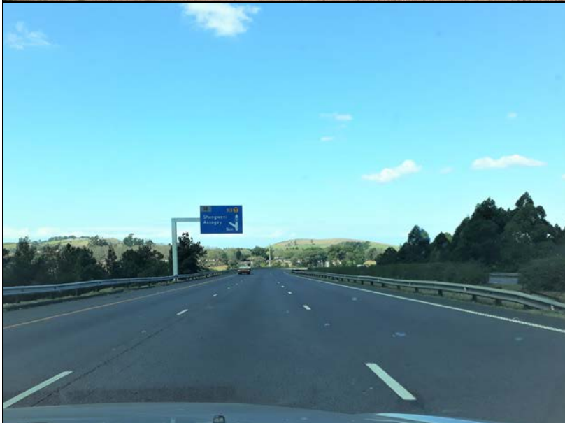
N3 Shongweni/Assagay exit 32 travelling east