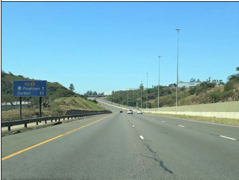
N3 between Mahogany Ridge and Richmond Road IC, travelling east towards Durban.