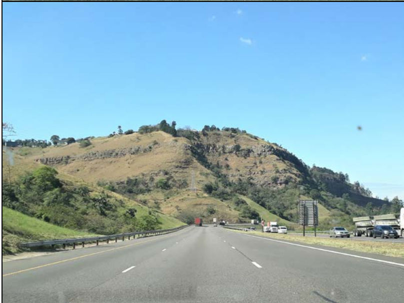
N3 travelling east, approaching Mariannahill toll Plaza