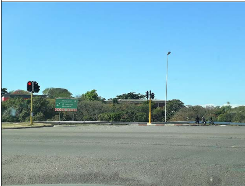
The Richmond Road IC, looking SE towards Edgewood Campus