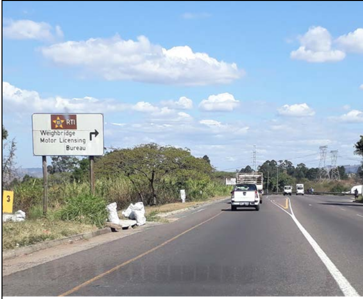
M1 travelling north west from the Richmond Road IC, towards Pinetown Motor Licensing