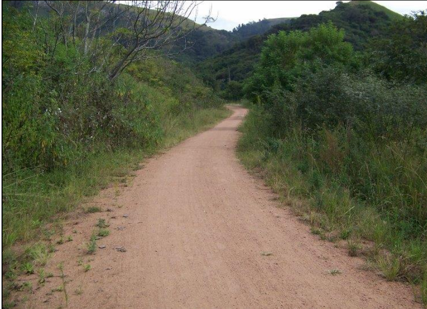
Existing dirt road which will be used for hauling through Giba Gorge Mountain Bike Park.